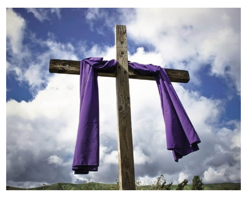
Preparing for Lent

It might seem that Christmas and Epiphany arte barely over but it's now time to turn our thoughts to Lent.