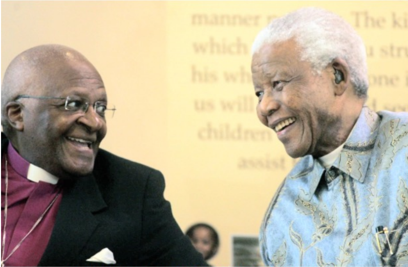
In conversation with Nelson Mandela, 2008

Desmond Mpilo Tutu was born in a small gold-mining town in what was then the Transvaal. He first followed in his father's footsteps as a teacher, but left after the passage of the Bantu Education Act in 1953 which introduced racial segregation in schools.