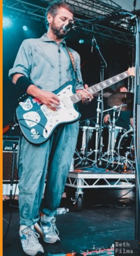
'Feeder' a UK rock legend!

There was a welcome return of comedy with The Cheshire Cat, and the Vinyl Frontier was ever popular with the late night revellers. The wellbeing area increased in size allowing for a gentler festival vibe. Nibley had something to suit all moods.